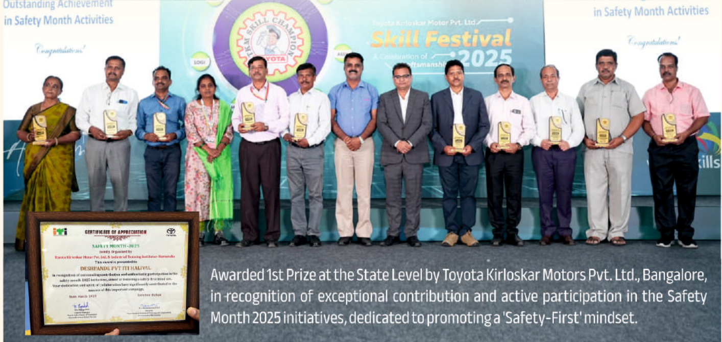
Awarded 1st Prize at the State Level by Toyota Kirloskar Motors Pvt. Ltd., Bangalore, in recognition of exceptional contribution and active participation in the Safety Month 2025 initiatives, dedicated to promoting a 'Safety-First' mindset.