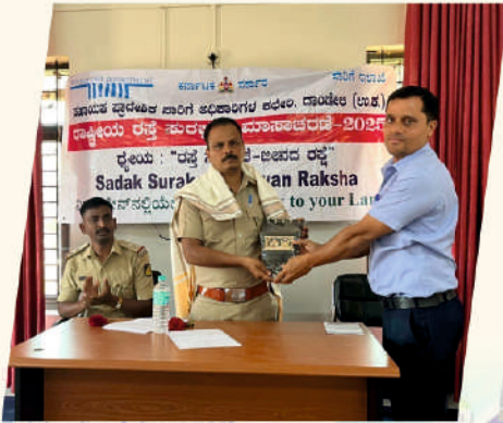
Outstanding Achievement in Safety Month Activities