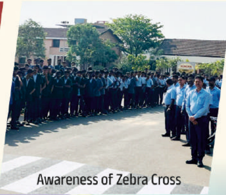
Awareness of Zebra Cross