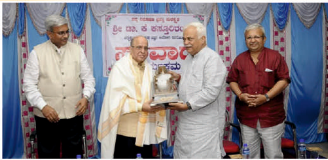
Shri Kasturi Rangan : Visited our Institute on 02.12.2018.