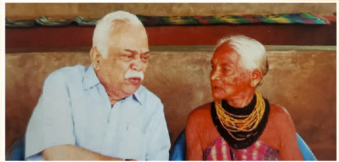
Our Chairman with Padmashree Tulasi Gowda