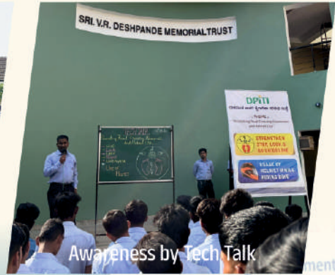
Awareness by Tech Talk